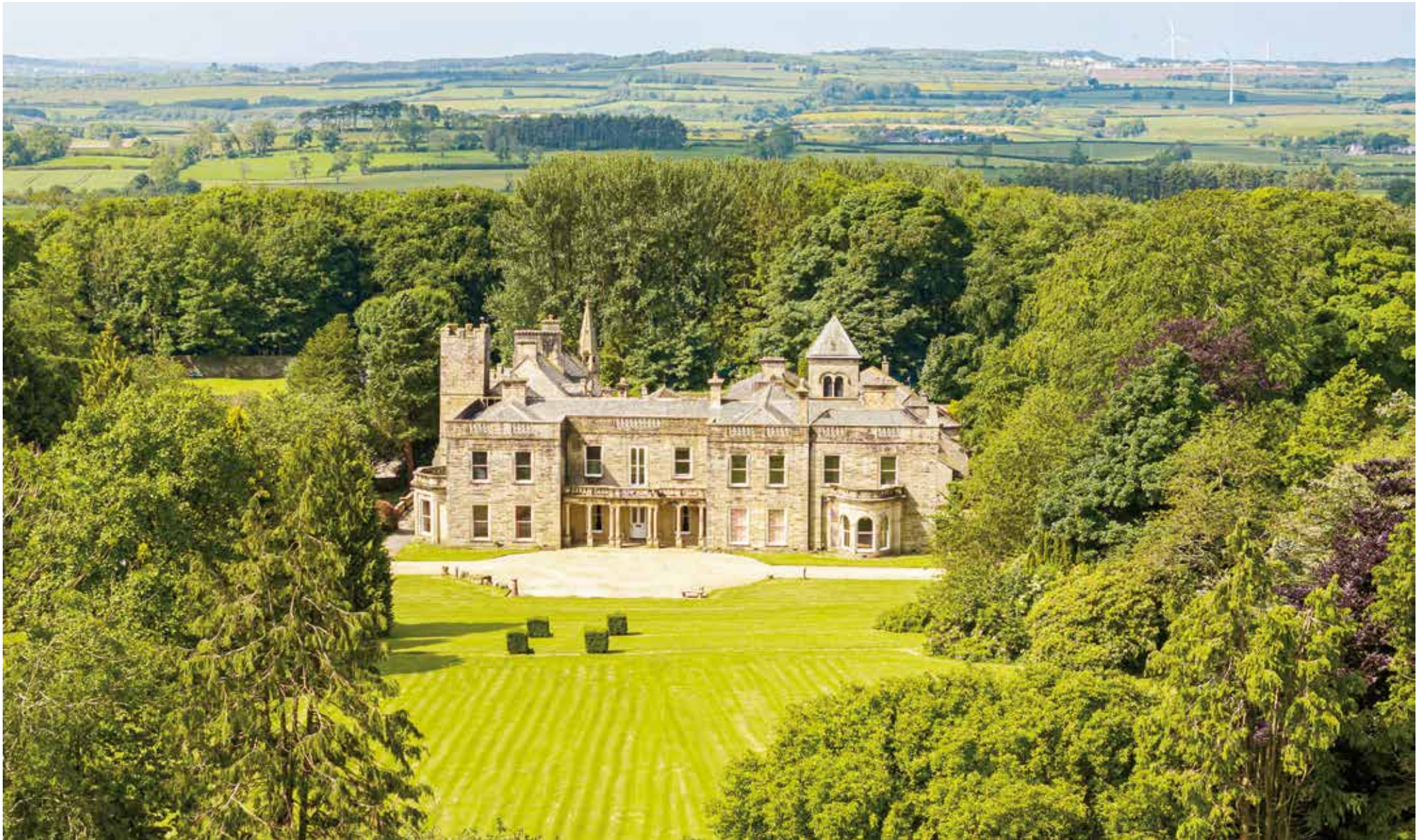
Tallentire Hall Tallentire | Cockermouth | Cumbria | CA13 0PR